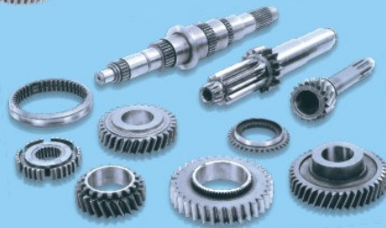
Gears & Shafts for all ZF Synchromesh Gear Boxes