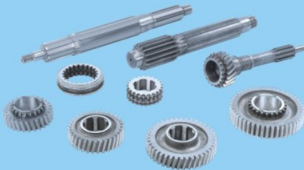
Gears & Shafts for all AL Constant Mesh Gear Boxes