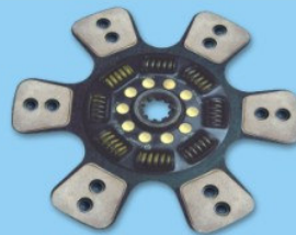
Ceramic Clutch Plates for AL Vehicles