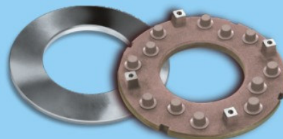
Pressure / Face Plates for all AL Vehicles